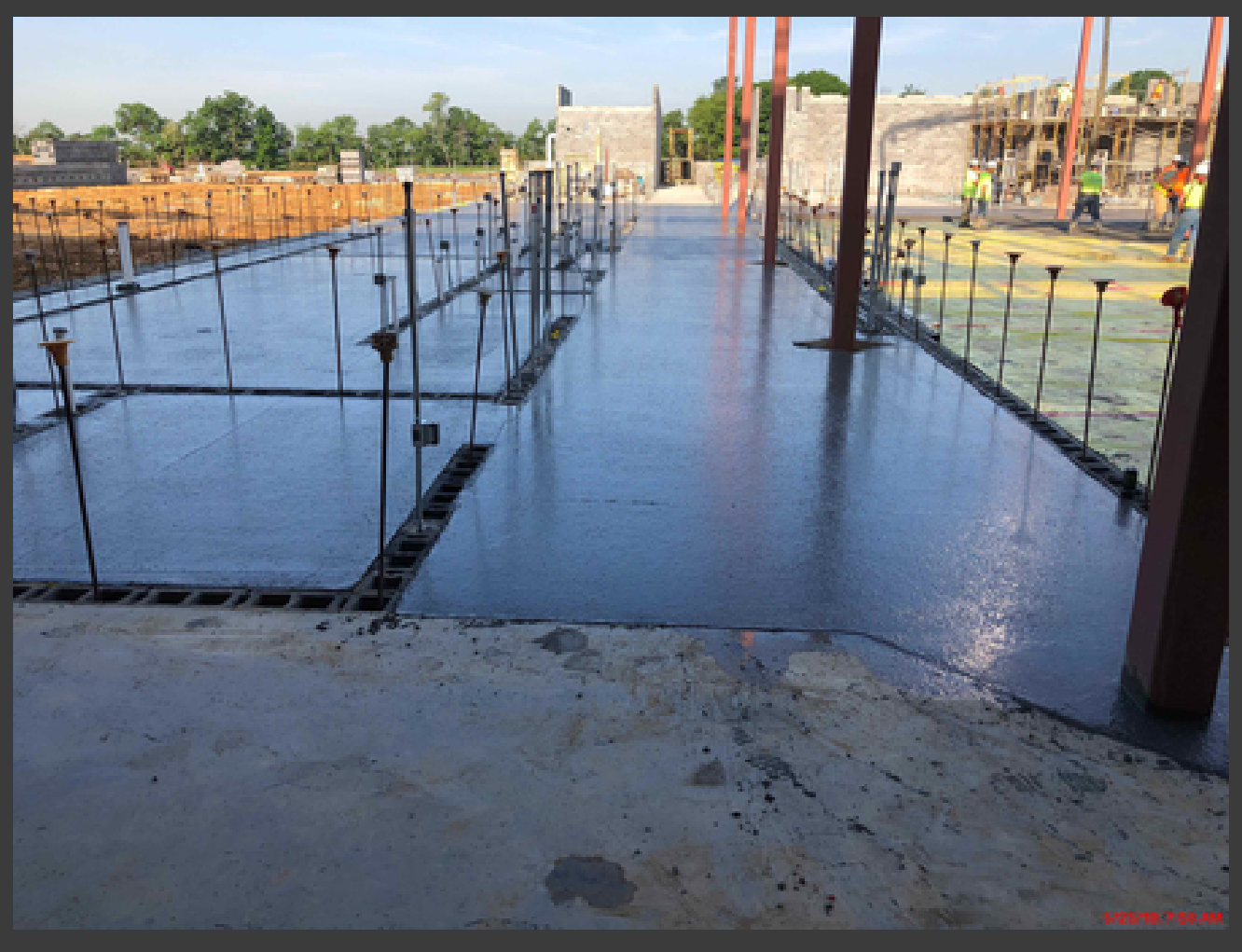
Slab Poured in Areas D and E