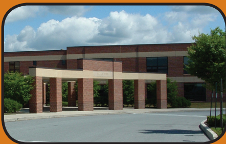
Eagle View Middle School 6746 Carlisle Pike Mechanicsburg, PA 17050 Phone: 717-506-3805