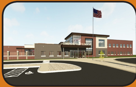
Winding Creek Elementary School (Opening Fall 2018) 32 Bali Hai Road Mechanicsburg, PA 17050 Phone: TBA