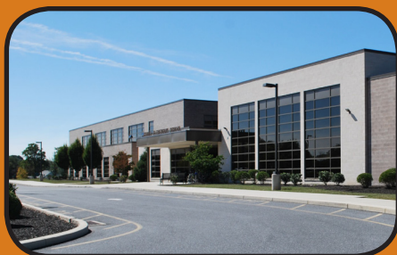
Shaull Elementary School 1 Shaull Drive Enola, PA 17025 Phone: 717-732-2460