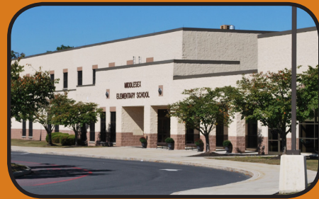
Middlesex Elementary School 250 North Middlesex Road Carlisle, PA 17013 Phone: 717-249-5586 or 717-697-2362