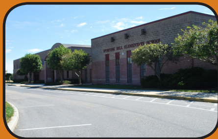
Sporting Hill Elementary School 210 S. Sporting Hill Rd. Mechanicsburg, PA 17050 Phone: 717-761-5052