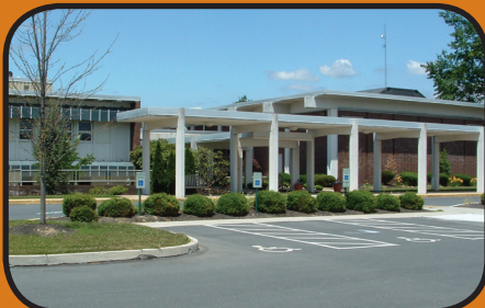
Hampden Elementary School 441 Skyport Road Mechanicsburg, PA 17050 Phone: 717-737-4513