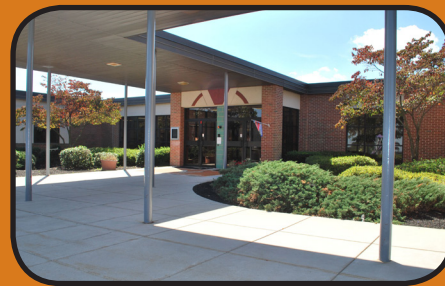
Silver Spring Elementary School 6746 Carlisle Pike Mechanicsburg, PA 17050 Phone: 717-506-3755