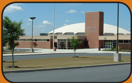
Cumberland Valley High School 6746 Carlisle Pike Mechanicsburg, PA 17050 Phone: 717-766-0217